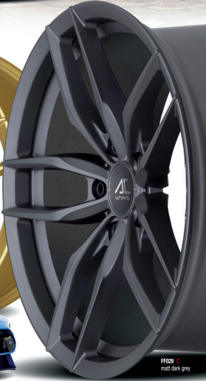
FF029 C matt dark grey