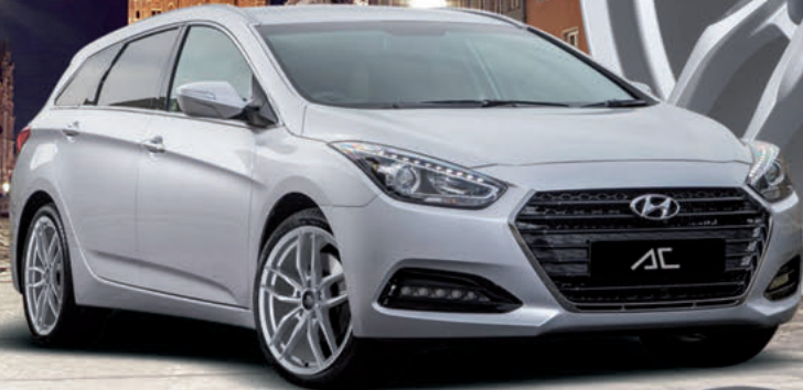
FF029 18" high gloss silver