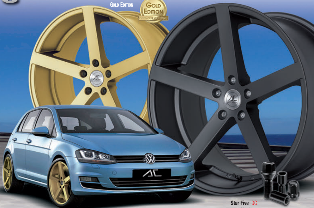
Star Five DC matt black