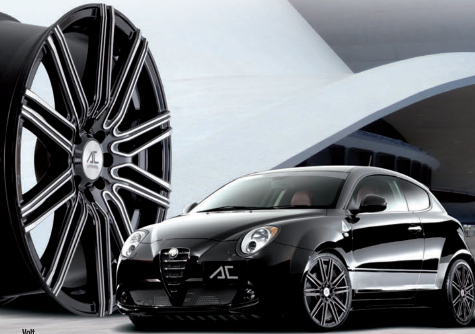
Volt dark shiny black, face polished