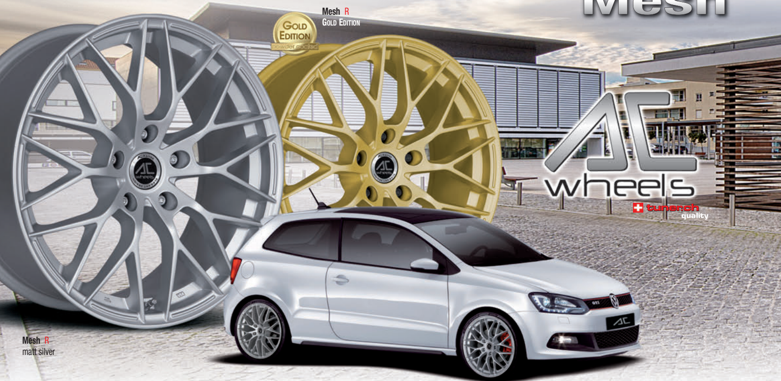
Mesh R matt silver