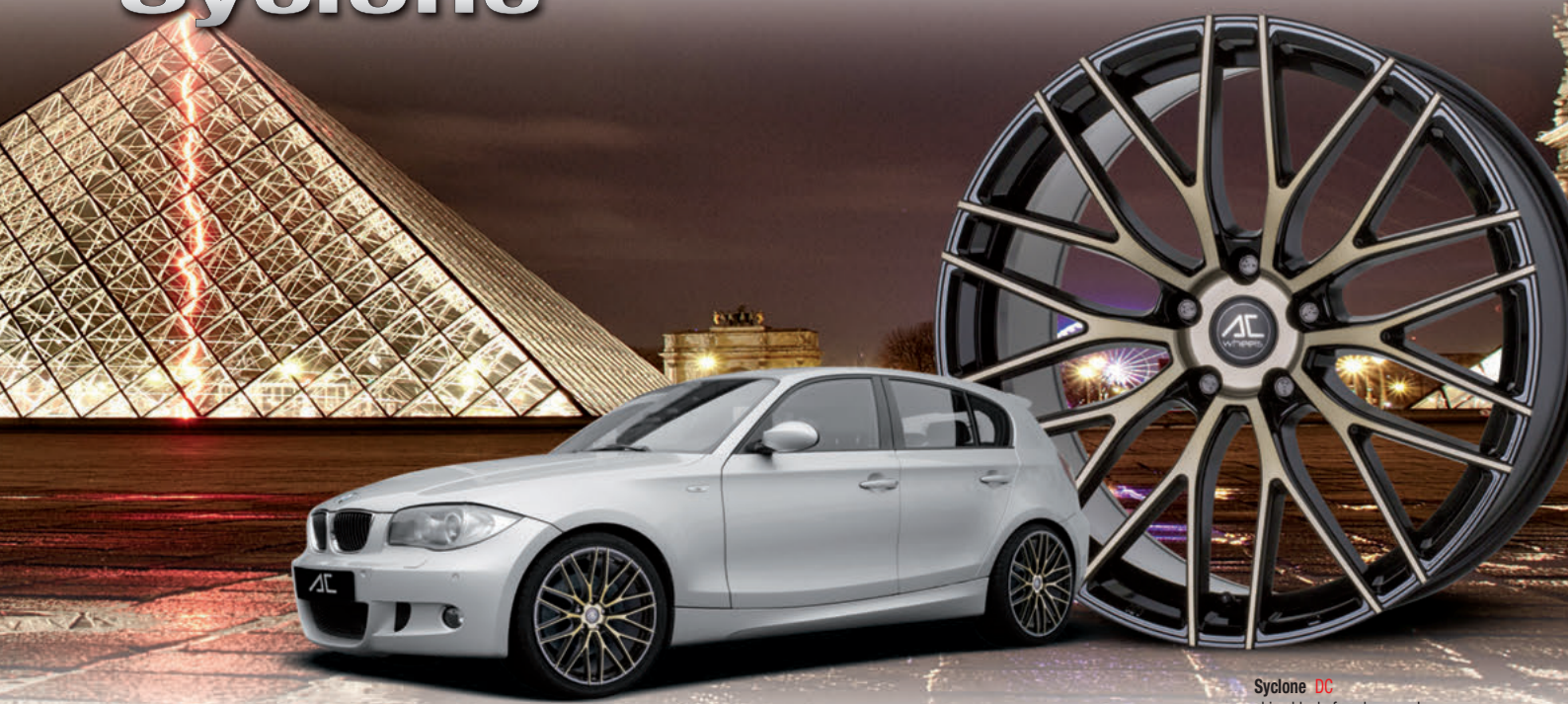
Syclone DC shiny black, face bronze clear