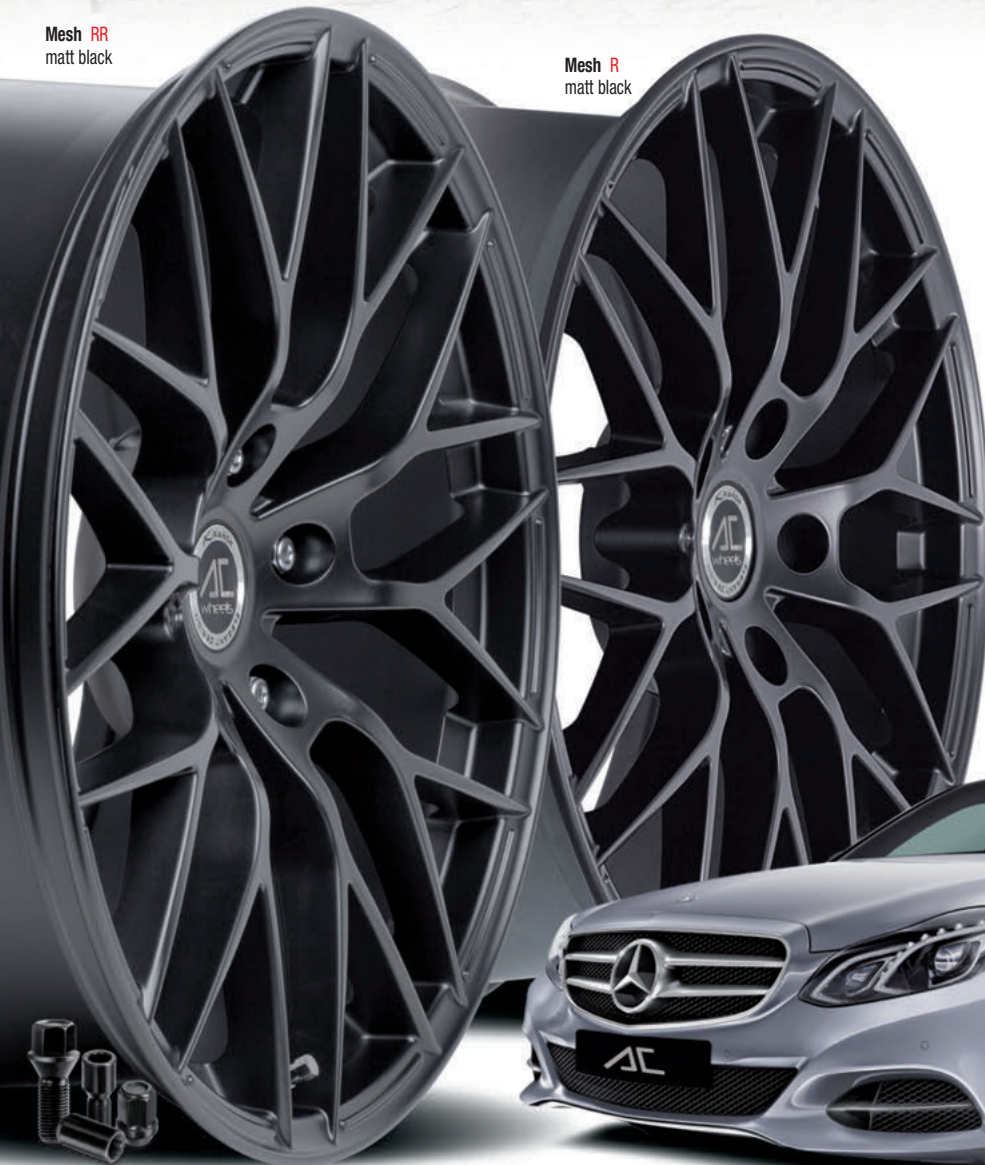
Mesh R matt black